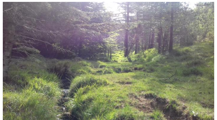
Parc naturel du Val d'Aveto – Passo della Gonella