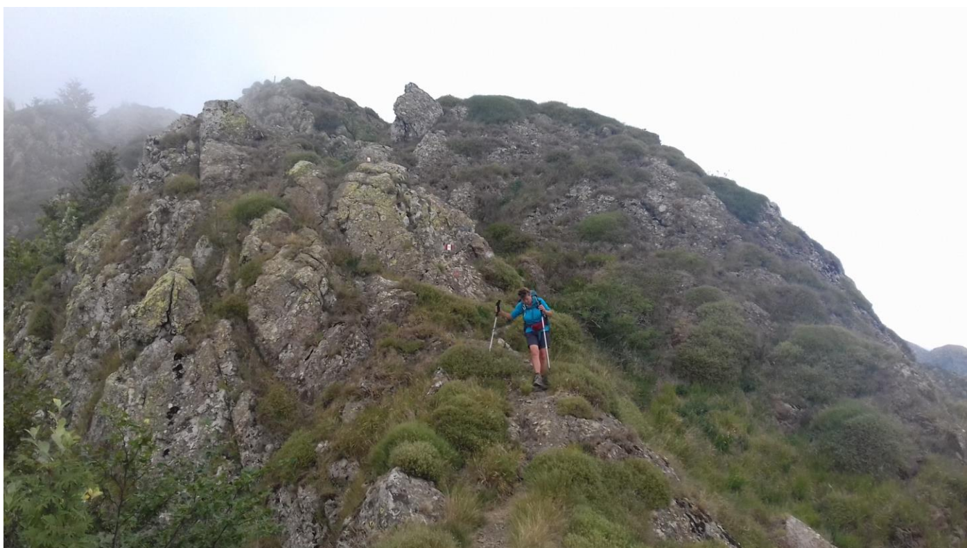
Descente sportive vers le Passo del Bocco