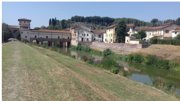
Ponte a Cappiano