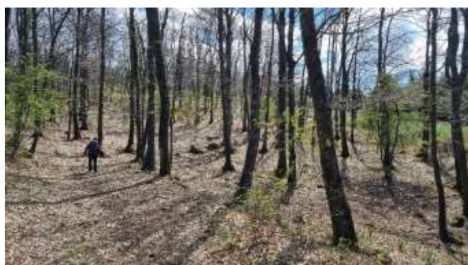
Montenero (925 m)