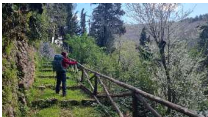
Sanctuaire de Saint Matthieu