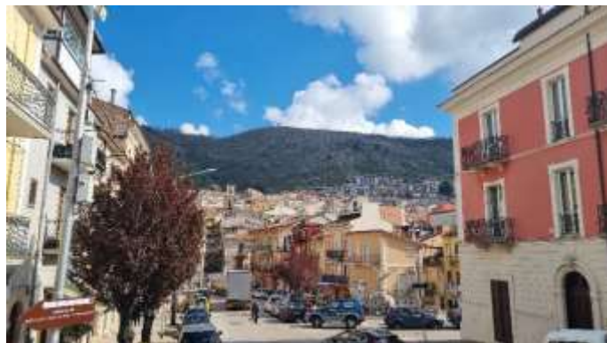
San Marco in Lamis