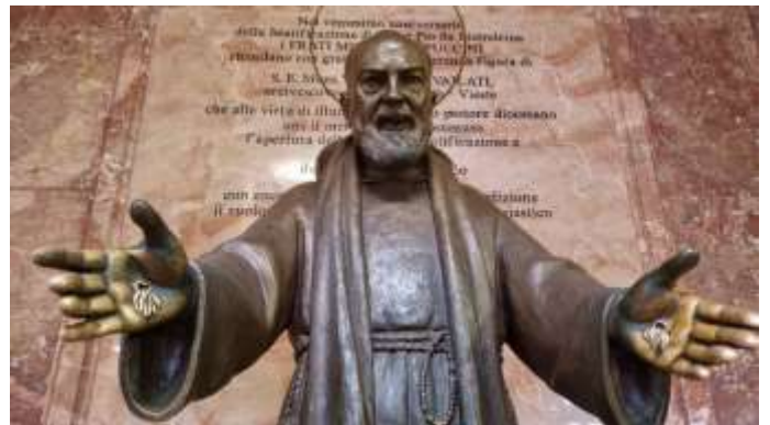
Basiliques de San Giovanni Rotondo